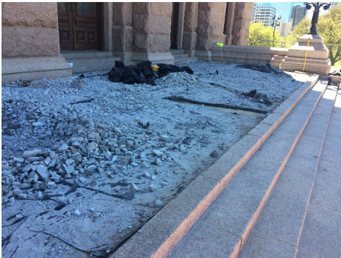
IMG_8766 west deck demol to 1993 waterproofing

Beams below the east and west decks are being exposed and coated to prevent further rusting from any moisture in these exterior environments. The masonry vaults are being repointed and plaster is being applied. The result will be an aesthetically clean appearance and, more important, a well-preserved historic structure.