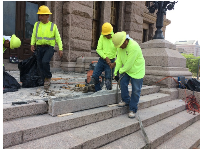
IMG_8892 workers removing top step to allow waterproofing to shed water