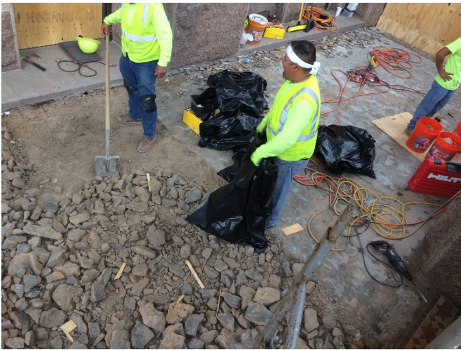
IMG_9201 removal of setting bed below tile at north deck level 2