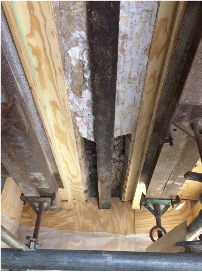
IMG_8991 vaults below shored and beam exposed for inspection and coating