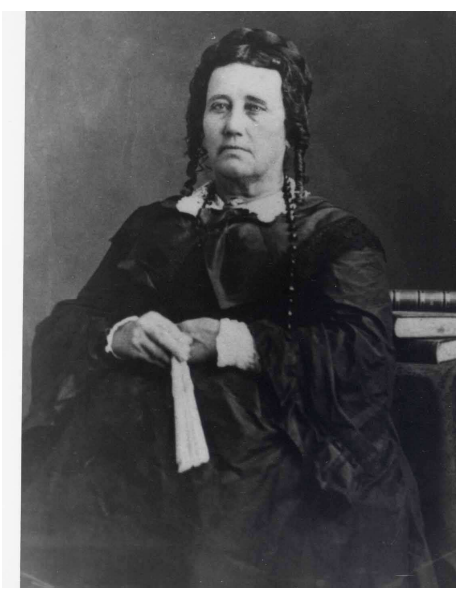
Susanna Dickinson, one of the featured Texas heroes.