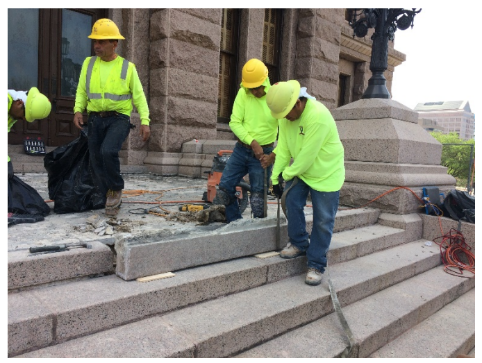
IMG_8892 workers removing top step to allow waterproofing to shed water