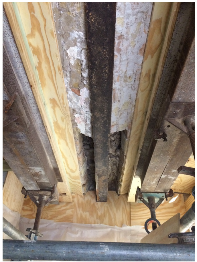
IMG_8991 vaults below shored and beam exposed for inspection and coating