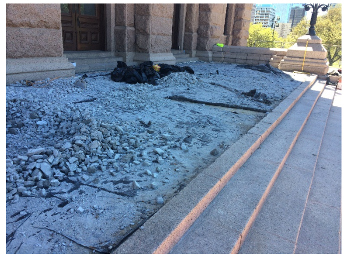
IMG_8766 west deck demod to 1993 waterproofing

Beams below the east and west decks are being exposed and coated to prevent further rusting from any moisture in these exterior environments. The masonry vaults are being repointed and plaster is being re-applied. The result will be an aesthetically clean appearance and, more important, a well-preserved historic structure.