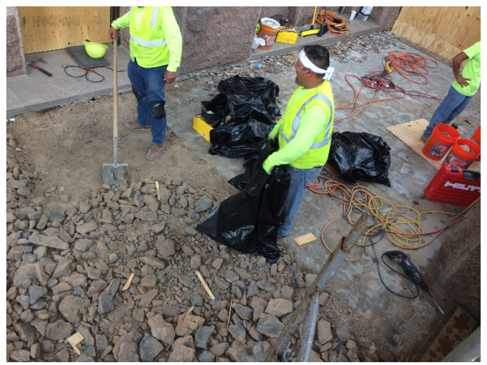
IMG_9201 removal of setting bed below tile at north deck level 2